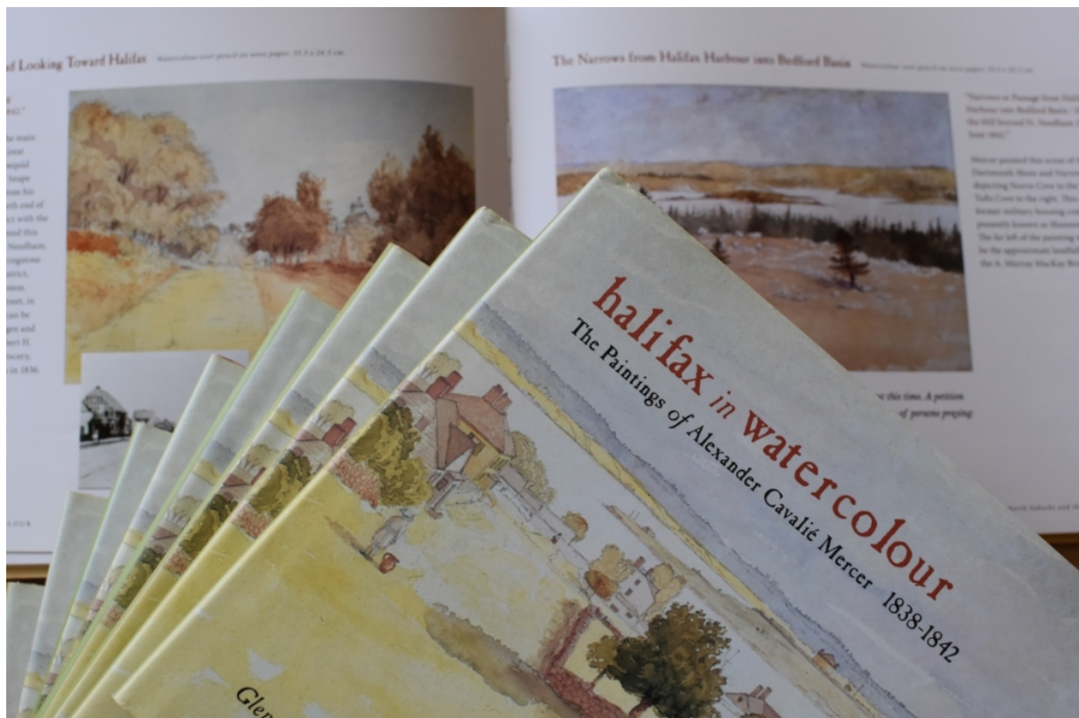
A few of the 100 copies waiting to find a good home